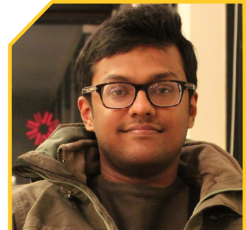
Alagappan Computer Waves

Organisation Skill in Terms of Technology: Partner for Hardware & Software