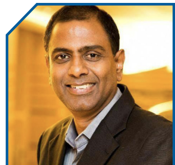
L Ashok Futurenet Technologies India Pvt. Ltd.

Organisation Skill in Terms of Technology: Holistic Out Come Based Digital Transformation , Audit / Assessment - Performance Availability | Security | Scalability, Data Center Build, Cloud – Design, Cloud Migration, Cloud Automation, Microsoft - Infrastructure components , Artificial Intelligence - Infra - Design | Build | Manage, 24 x 7 Remote, Onsite, Hybrid Managed Services and Data Analytics