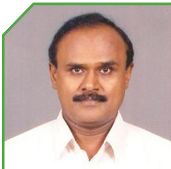
Nagaraj Spectra Systems

Customised ERP both onsite and cloud-based. Implementation of SAP