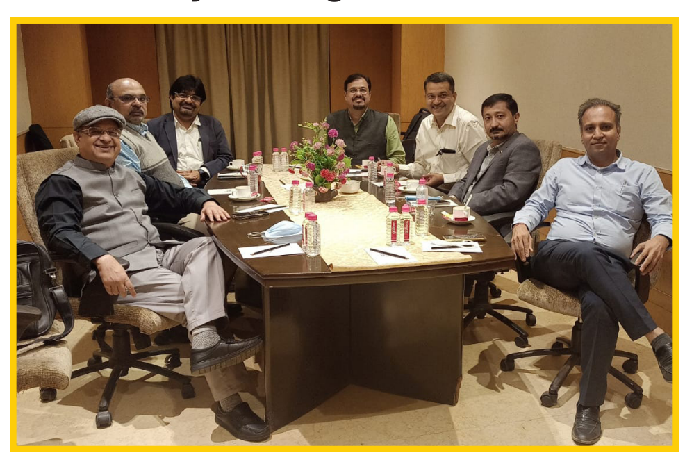
Kolkata Regional Meet